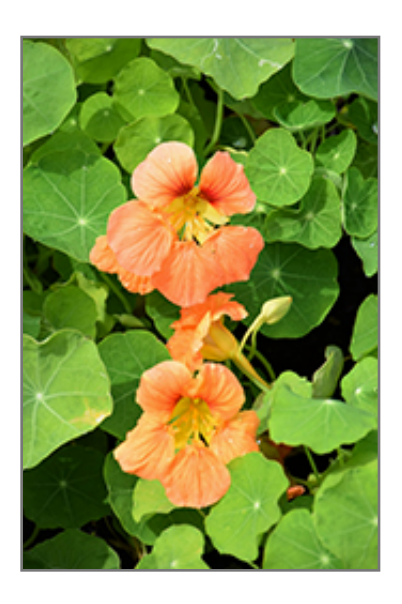
Jewel of Africa Nasturtium flowers