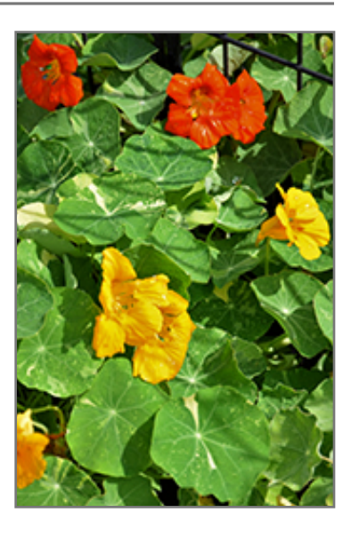
Jewel of Africa Nasturtium flowers