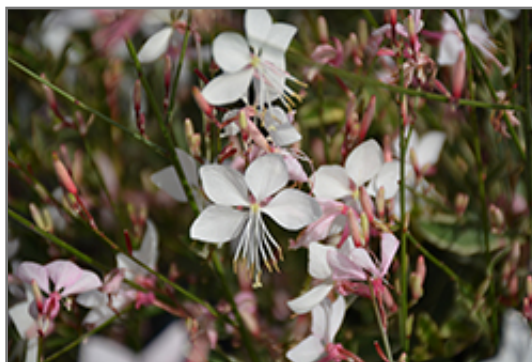
Walberton's Snow Fountain Gaura flowers

Walberton's Snow Fountain Gaura is recommended for the following landscape applications;