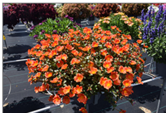
Mega Pazzaz Orange Portulaca in bloom