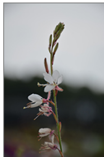
Grace Haze Gaura flowers

Grace Haze Gaura is recommended for the following landscape applications;