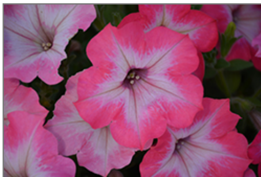
BigDeal Salmon Shimmer Petunia flowers