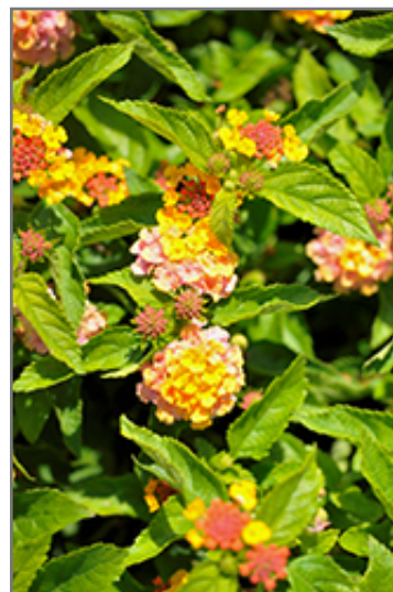
Gem Compact Rose Quartz Lantana flowers