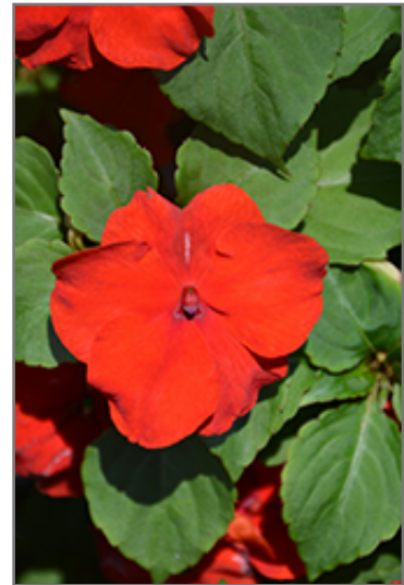
Xtreme Red Impatiens flowers