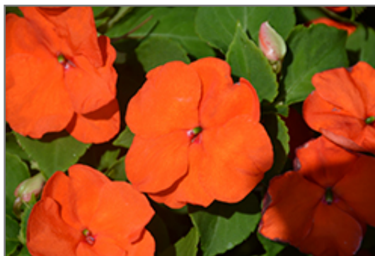
Xtreme Orange Impatiens flowers

Xtreme Orange Impatiens is recommended for the following landscape applications;