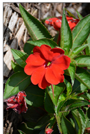
SunStanding Fire Red Impatiens flowers