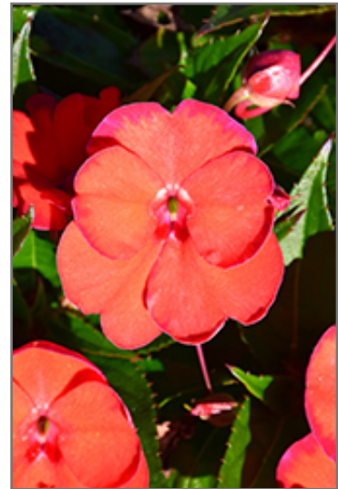
SunStanding Orange Aurora Impatiens flowers