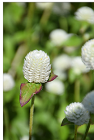
Las Vegas White Gomphrena flowers

Las Vegas White Gomphrena is recommended for the following landscape applications;