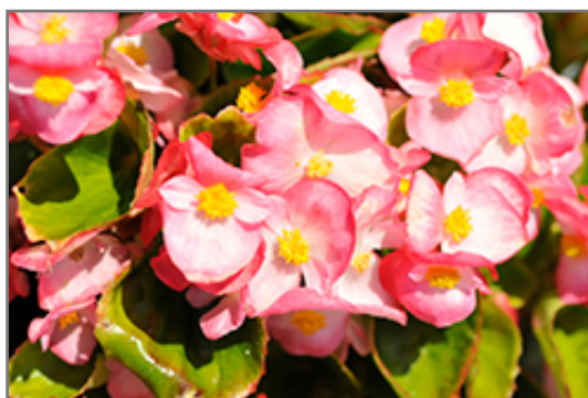
Super Cool Blush Begonia flowers

Super Cool Blush Begonia is recommended for the following landscape applications;