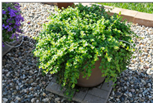
Indian Mint