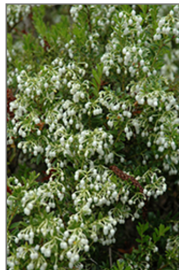
Chilean Wintergreen flowers