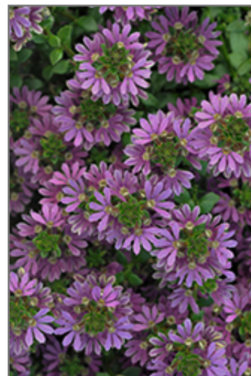
Surdiva Purple Fan Flower flowers