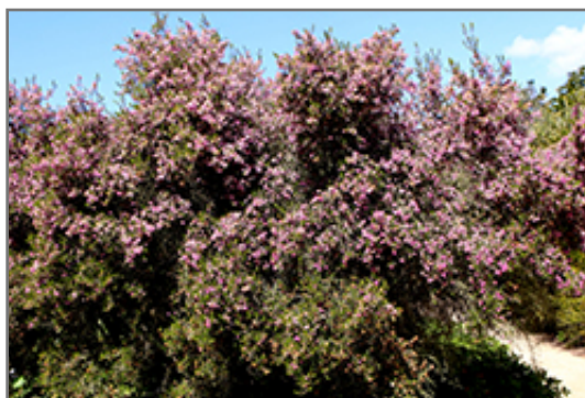
Pink Channelled Heath in bloom