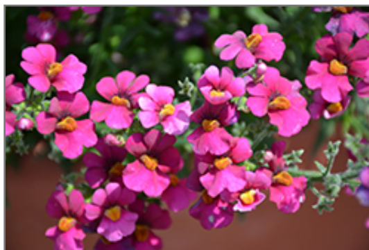
Nessie Plus Purple Nemesia flowers