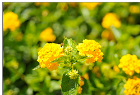
Landmark Gold Lantana flowers

Landmark Gold Lantana is recommended for the following landscape applications;