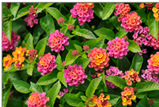
Bloomify Rose Lantana flowers

Bloomify Rose Lantana is recommended for the following landscape applications;