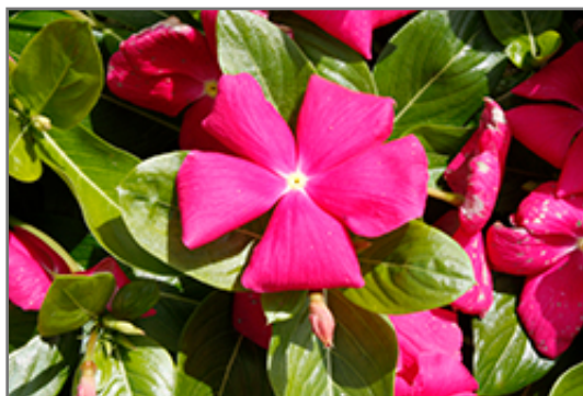
Cora Cascade Bright Rose Vinca flowers

Cora Cascade Bright Rose Vinca is recommended for the following landscape applications;