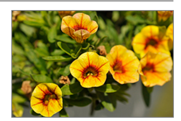
Colibri Mellow Yellow Calibrachoa flowers