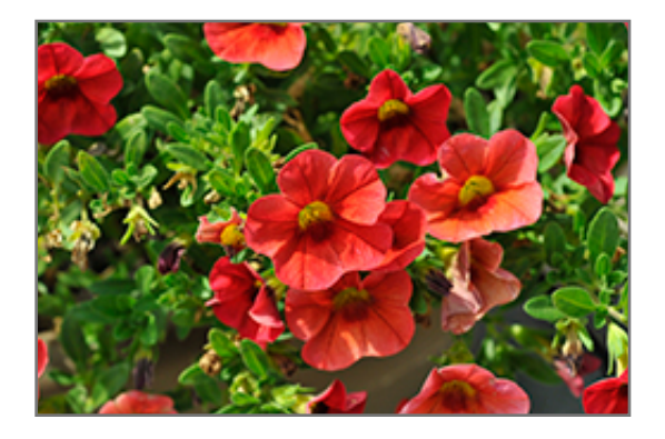
Calitastic Blood Orange Calibrachoa flowers