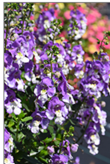
Alonia Big Bicolor Purple Angelonia flowers

Alonia Big Bicolor Purple Angelonia is recommended for the following landscape applications;