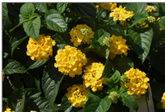
Lucky Yellow Lantana flowers