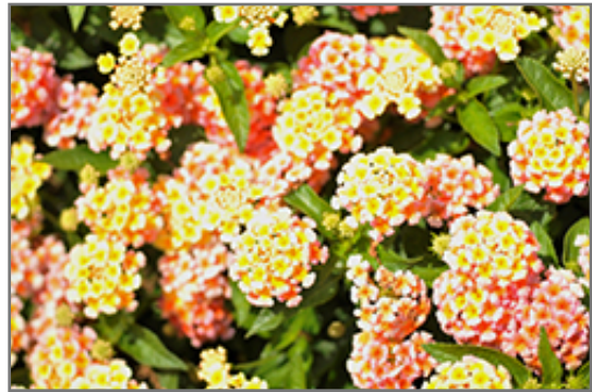
Lucky Peach Lantana flowers