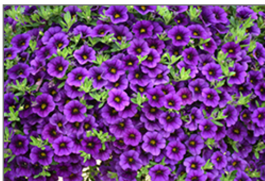
MiniFamous Uno Blue Calibrachoa flowers