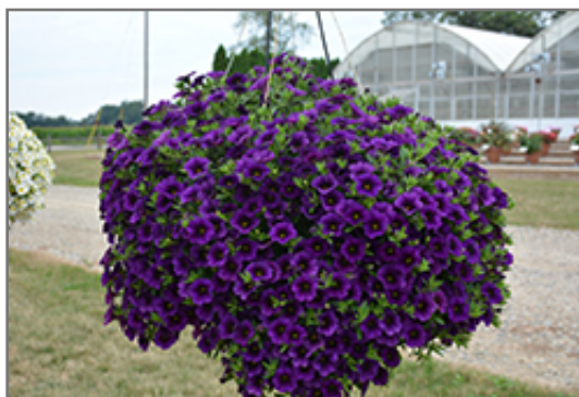
MiniFamous Uno Blue Calibrachoa in bloom