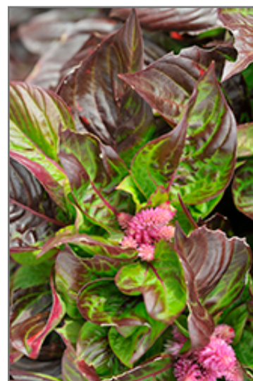
Sol Gekko Green Celosia flowers