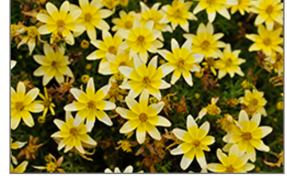
Taka Tuka White and Yellow Center flowers

This stunning selection showcases flowers with white tips and yellow centers; a well branched variety that is ideal for flower beds, large containers and hanging baskets; attracts pollinators; long blooming season