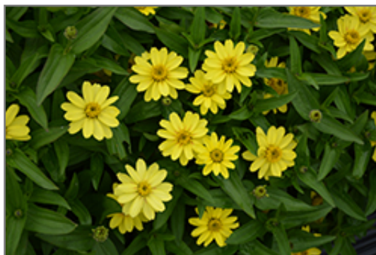
Profusion Lemon Zinnia flowers