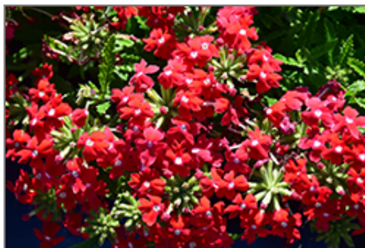
Obsession Cascade Red with Eye flowers

Obsession Cascade Red with Eye is recommended for the following landscape applications;