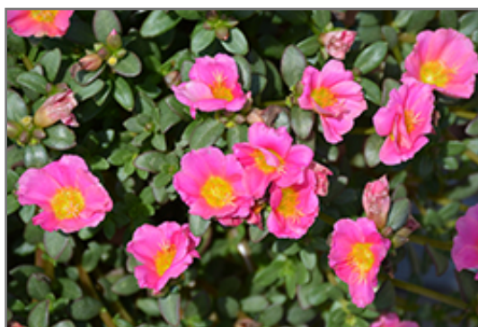
Pazzaz Sweet Pink Portulaca flowers

Pazzaz Sweet Pink Portulaca is recommended for the following landscape applications;