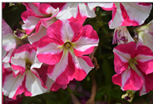
Perfectunia Kiss and Tell Petunia flowers