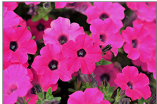
Itsy Magenta Petunia flowers