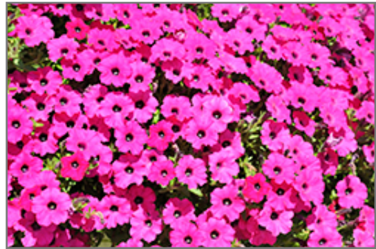
Itsy Magenta Petunia flowers

Itsy Magenta Petunia is recommended for the following landscape applications;