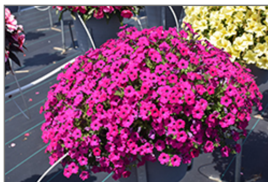
Itsy Magenta Petunia in bloom