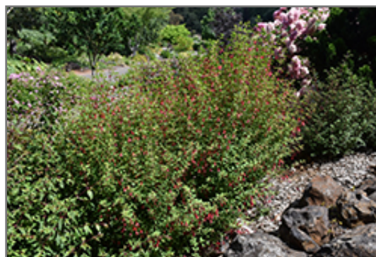
Thompsonii Hardy Fuchsia in bloom