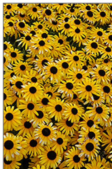
Viette's Little Suzy Coneflower flowers