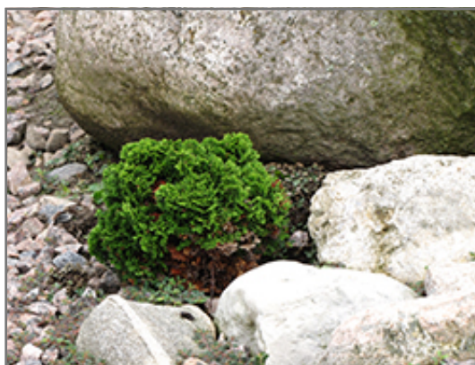
Stoneham Hinoki Falsecypress