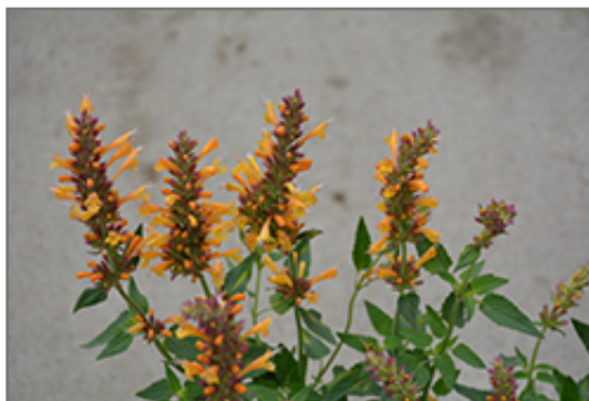
Kudos Gold Hyssop flowers

Kudos Gold Hyssop will grow to be about 16 inches tall at maturity extending to 22 inches tall with the flowers, with a spread of 20 inches. It grows at a fast rate, and under ideal conditions can be expected to live for approximately 6 years. As an herbaceous perennial, this plant will usually die back to the crown each winter, and will regrow from the base each spring. Be careful not to disturb the crown in late winter when it may not be readily seen!