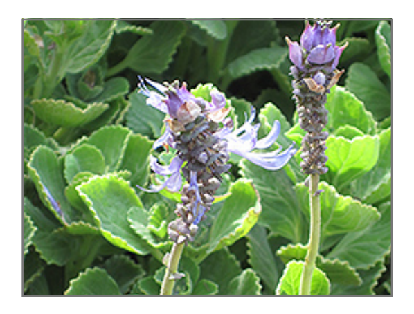
Lobster Flower flowers

Lobster Flower is an herbaceous annual with a ground-hugging habit of growth. Its relatively fine texture sets it apart from other garden plants with less refined foliage.