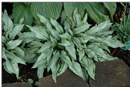
Majeste Lungwort