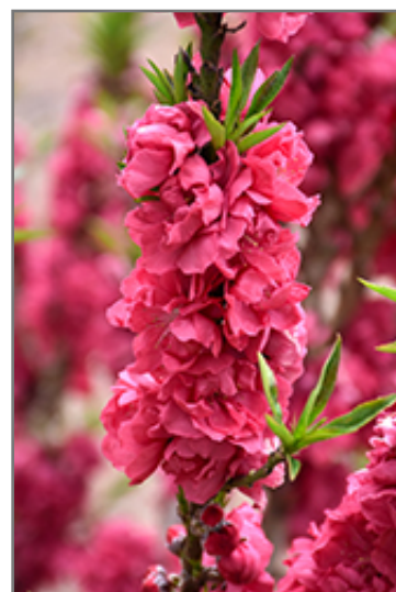
NCSU Dwarf Double Red Flowering Peach flowers