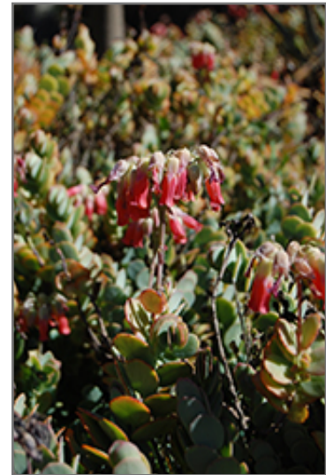
Marnier's Kalanchoe flowers

This plant is not reliably hardy in our region, and certain restrictions may apply; contact the store for more information.