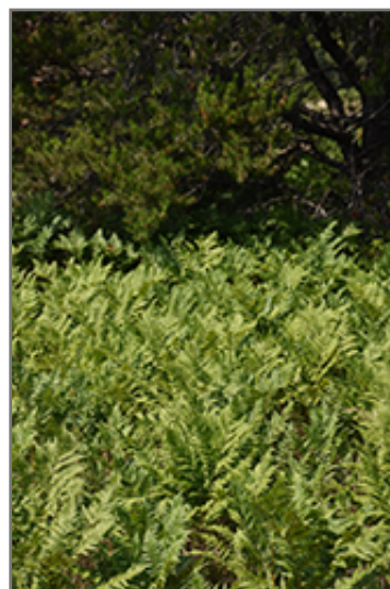
Bracken Fern