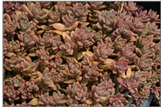
Vera Higgins Graptosedum

Vera Higgins Graptosedum is recommended for the following landscape applications;