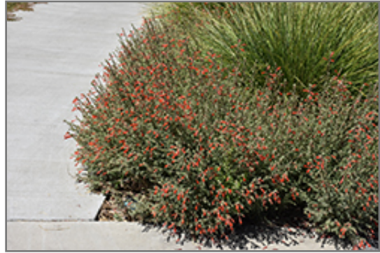
California Fuchsia in bloom

California Fuchsia will grow to be about 24 inches tall at maturity, with a spread of 4 feet. Its foliage tends to remain dense right to the ground, not requiring facer plants in front. It grows at a medium rate, and under ideal conditions can be expected to live for approximately 10 years. As an herbaceous perennial, this plant will usually die back to the crown each winter, and will regrow from the base each spring. Be careful not to disturb the crown in late winter when it may not be readily seen!