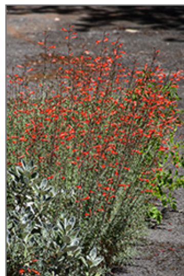
California Fuchsia in bloom

California Fuchsia is recommended for the following landscape applications;