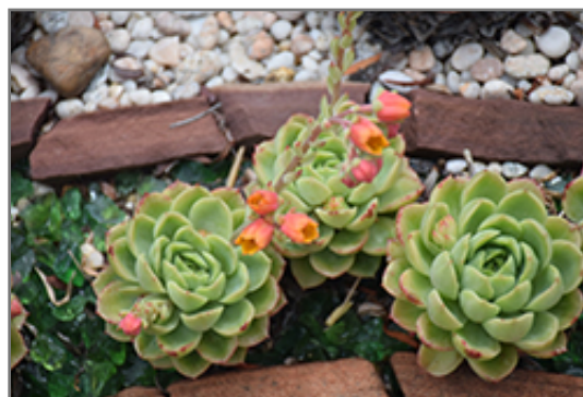
Grey Red Echeveria in bloom