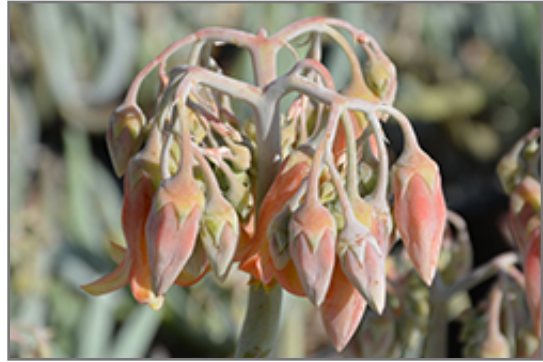
Flavida Finger Aloe flower buds

Flavida Finger Aloe is recommended for the following landscape applications;