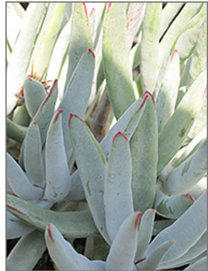
Flavida Finger Aloe foliage

This plant is not reliably hardy in our region, and certain restrictions may apply; contact the store for more information.