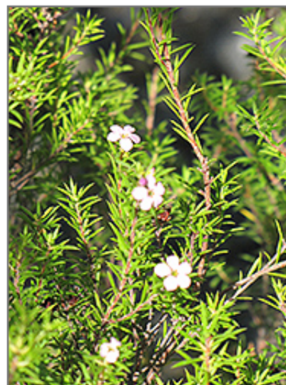
Compact Diosma flowers