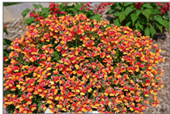
Babycakes Little Orange Nemesia in bloom