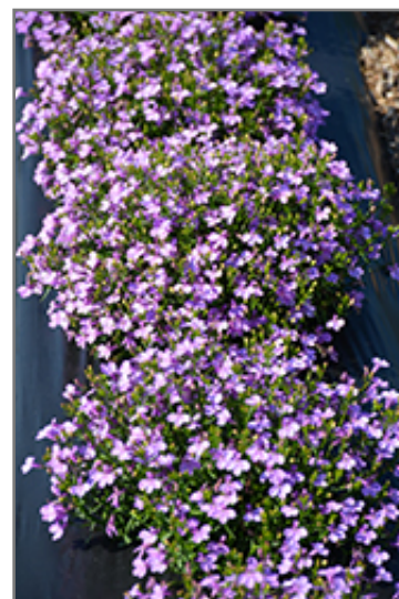
Lobelix Lilac Lobelia in bloom