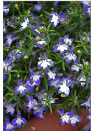
Lobelix Blue White Eye Lobelia flowers